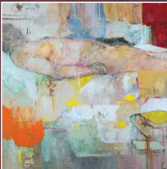
Early Morning , acrylic on raw canvas, 60 x 60"