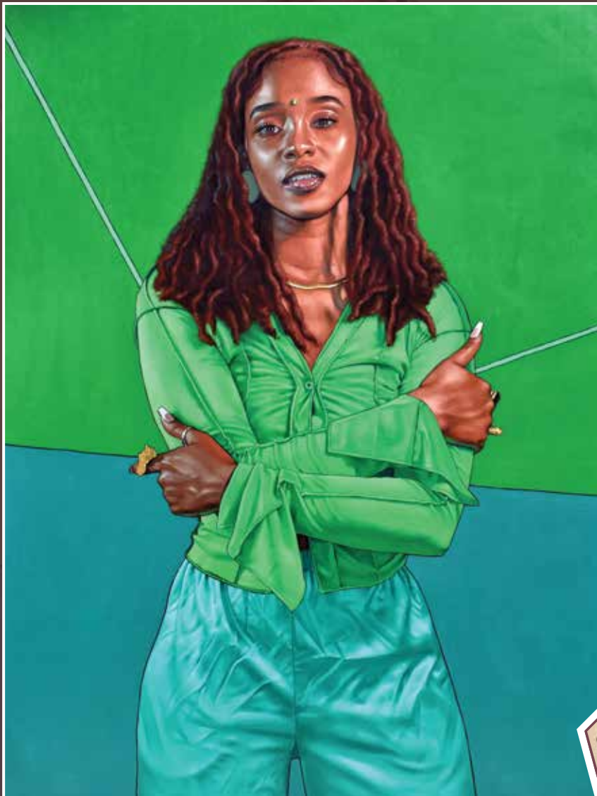
NiaJune , oil on canvas, 36 x 48". Image courtesy the artist and Galerie Myrtilis - The Gregg J. Justice III Collection