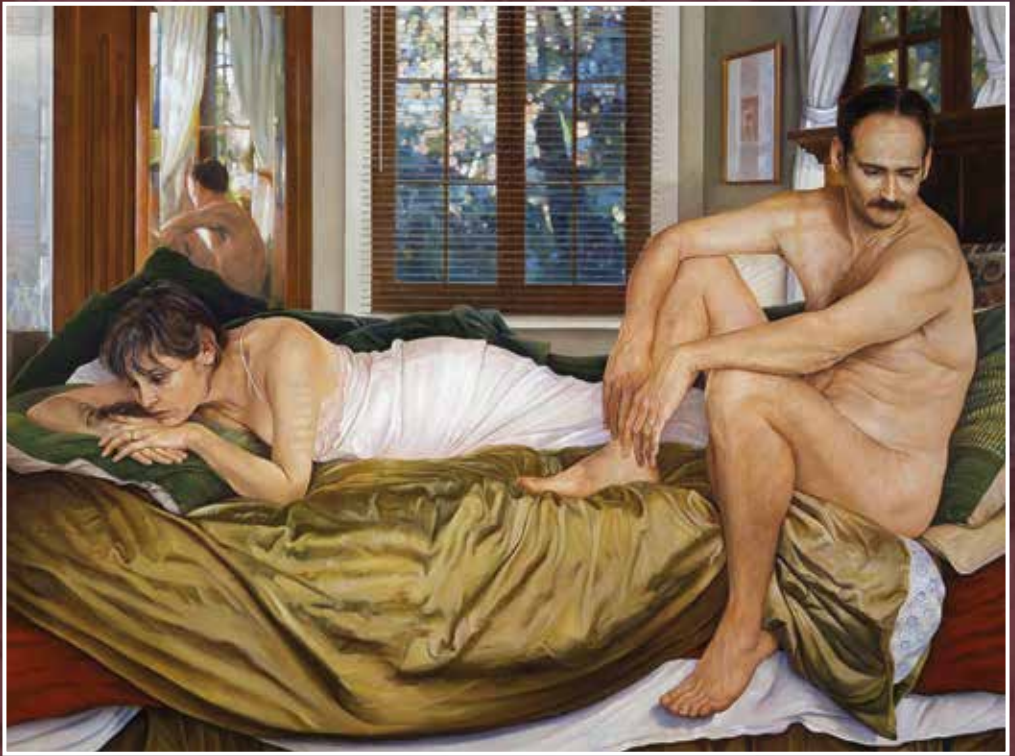
Marital Bliss , oil on canvas, 40 x 76"