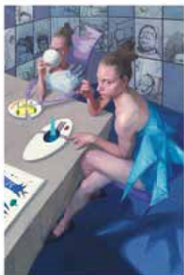
ASMR, oil on linen, 60 x 80"