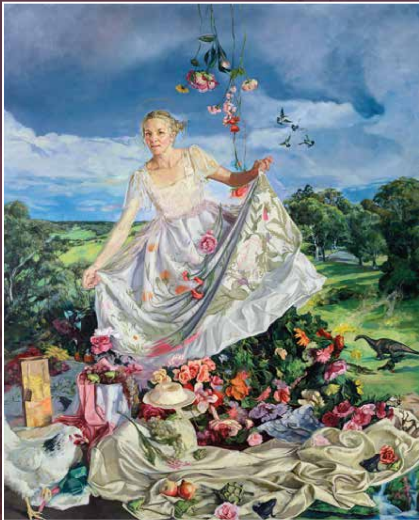
Flower Wars, oil on canvas, 60 x 48"