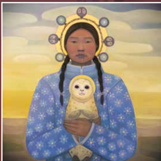
Iswiq's Blessing , oil on panel, 30 x 30"