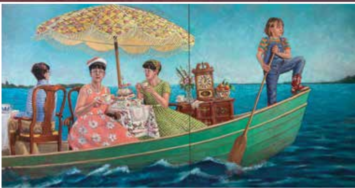
Don't Rock the Boat , oil on canvas, 50 x 92"

Points and Palms , oil on canvas, 60 x 48"